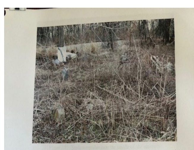
Figure 2.9: Vines, underbrush, gravemarkers, and trash between the cemetery and the CSX Transportation railroad at the property's southern edge Photo view: South; Date: January 18, 2023.