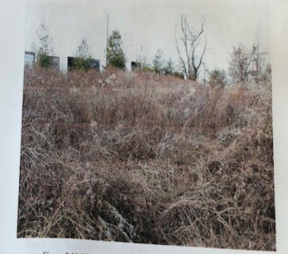
Figure 2.10: Thick underbrush near the cemetery's western edge Photo view: Northwest; Photographer: Jason Harpe; Date: January 18, 2023.