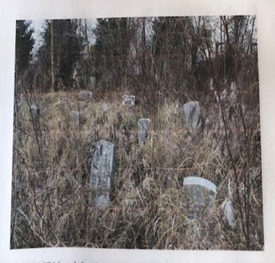
Figure 2.16: Thick underbrush and gravemarkers near the cemetery's northern edge Photo view: North; Date: January 18, 2023.