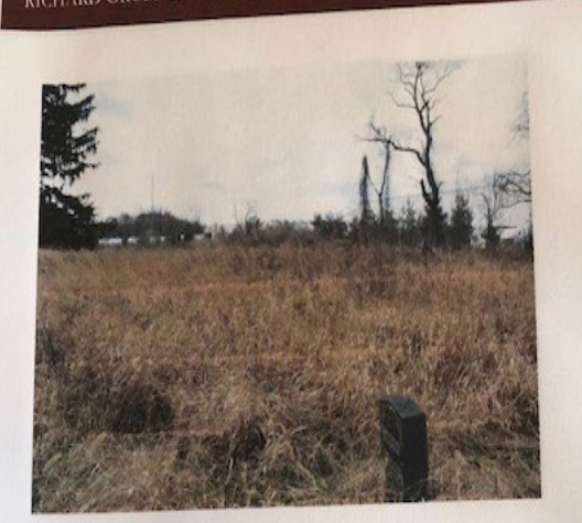
Figure 2.15: Thick underbrush and gravemarkers near the cemetery's northern edge Photo view: West; Date: January 18, 2023.